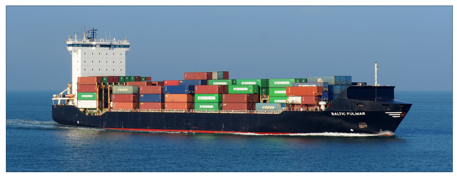
The Baltic Fulmar was sold to a Chinese shipowner in 2023 and renamed the NewNew Polar Bear. The NewNew Polar Bear is suspected of severing undersea cables in the Baltics.