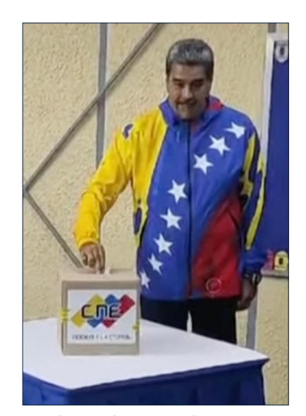
Nicolas Maduro casts his vote in the 2024 Venezuelan presidential election.

"These adjustments occur amid repeated attempts by the opposition to force the Armed Forces to 'respect' the results of the elections of July 28, after which the Chavista leader was proclaimed reelected amid allegations of fraud."