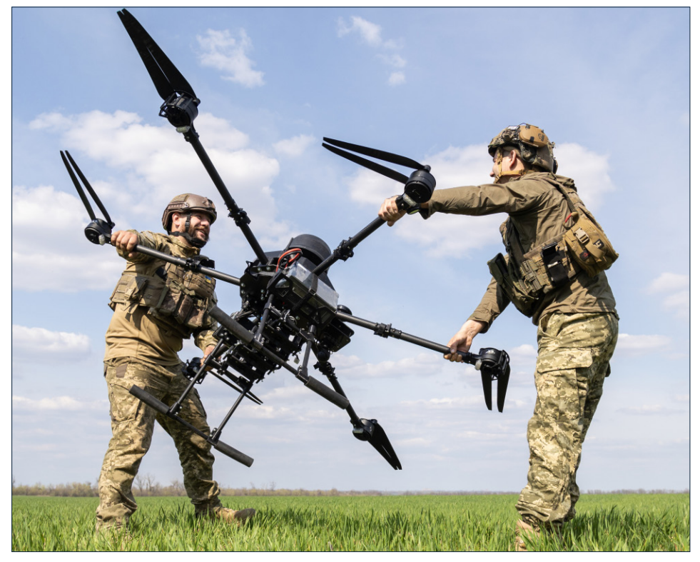
Ukrainian Soldiers handling a Baba Yaga UAV.

The accompanying excerpted article from the Russian daily newspaper Izvestia discusses the activities of the Volunteer Corps of the Russian Ministry of Defense's Española Brigade. The Española Brigade—currently numbering no more than 100 individuals, according to the founder—began as a volunteer formation of soccer enthusiasts, which now provides trained UAV operators and UAVs to support Russia's conventional force in the special military operation in Ukraine.1 According to the Izvestia article, the Española Brigade operates its own UAV training center and is developing its own UAVs for use in Ukraine. Although state UAV development programs are entrenched in both Russia and Ukraine, the development of UAV technologies by volunteer units and their personnel in the field also appears to be increasingly common on both sides of the front. It would now seem that the traditional model of governments procuring defense articles from private industry and then supplying these materials to the military is simply no longer effective given UAVs' rapidly evolving technology and newfound tactical uses. Indeed. both the Russian and Ukrainian militaries are now collaborating closely with industry to quickly deliver new capabilities to the battlefield as the requirements are recognized.