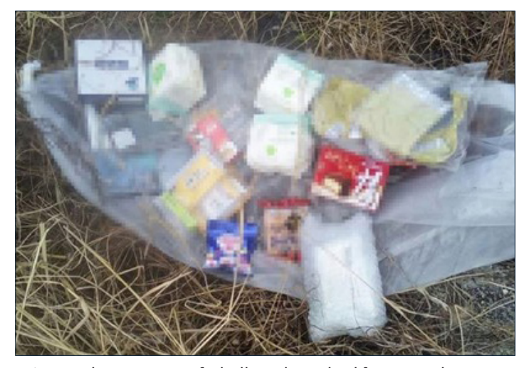
A before and after image from the same PRK state media article reporting on the contents of a balloon launched from South Korea. The first image was downloaded before the PRK decided to censor and pixelate the image, while the second one obscures the contents (Oct 15, 2024).