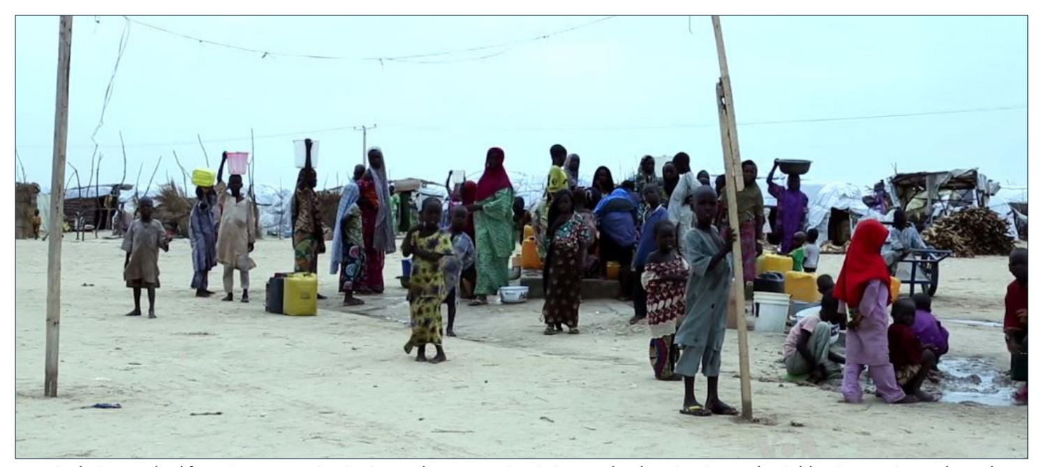
Despite being pushed from its core territories in northeastern Nigeria in 2015 by the Nigerian and neighboring armies and South African PMCs, Boko Haram reemerged by 2017, causing mass displacement of civilians and retaking many territories it had lost.

Ndume did not mention the company or origin of the PMCs whom he