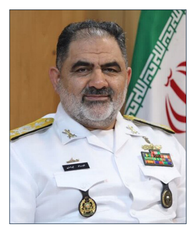
"Commander of the Navy of the Islamic Republic of Iran Shahram Irani," published on 3 November 2024.