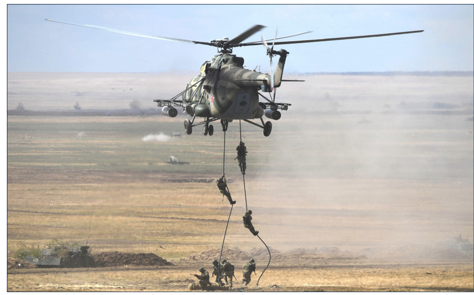
Russian soldiers fast-rope from helicopter during Centre 2019 strategic commandand-staff exercises.

Russia is mobilizing troops, not by traditional forced means, but financial inducements are now a key component of Russia's recruitment tactics. According to the second excerpted article from the Russian news agency Interfax, a new debt law is the most recent incentive passed to encourage participation in the military. The new law allows up to 10 million rubles ($96,000) of outstanding debt facing collection, previously incurred by a recruit and/or his or her spouse, to be written off if a recruit joins the force.1 Further, according to the third excerpted article from the Russian